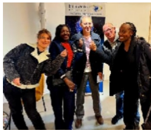
End of the conference