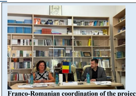
Franco-Romanian coordination of the project