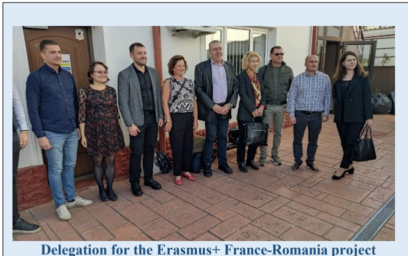
Delegation for the Erasmus+ France-Romania project

RENT Project - 2023-2-EN01-KA210-ADU-000174327